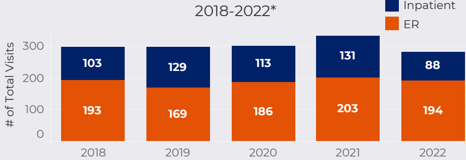
Figure 1. Nonfatal All Drug Overdose Health Care Utilization

Figure 1: St. Francois County is located in the St. Louis region of the state. Based on rates, St. Francois County ranks third in the region for drug related inpatient and ER visits. While there was an increase in 2021, total counts for both inpatient and ER visits have remained relatively steady throughout the past five years.