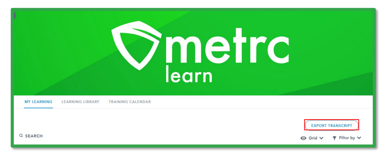
Figure 4: Export Transcript Feature

Users will be able to export and share their achievements in the training portal by using the "Export Transcripts" button under their learning library. This feature is shown below in Figure 4 .