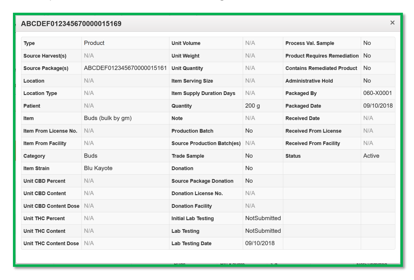
Figure 4: Package Details Popover Window

By clicking this button, this will trigger the full package details window that will not disappear once you move the mouse from magnifying glass button as it did previously. An example of this window is shown below in Figure 4 .