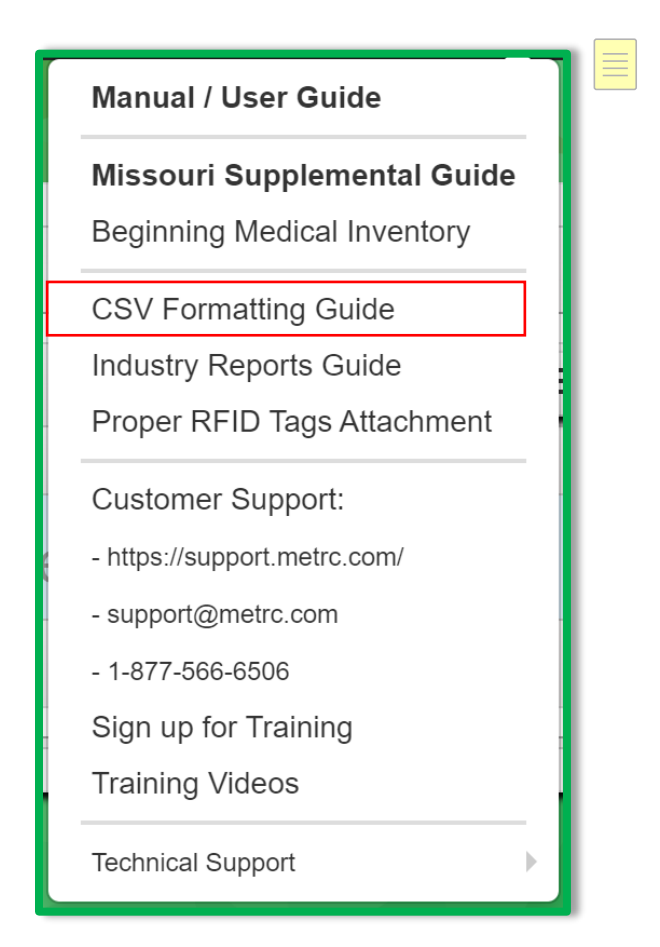
Figure 6: CSV Formatting Guide

Metrc has updated its CSV Formatting Guide to cover all available options. This Guide can be found under the support menu of the top navigational bar. This menu is shown in Figure 6 below.