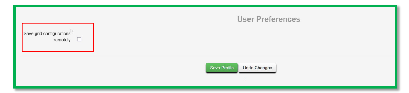
Figure 2: Save Grid Configurations Option

Once on the screen, the option to save grid configurations remotely can be seen under the User Preferences section of the page. If turning on the functionality to save the grid configurations, enable it by checking the box and saving the profile. This new option is shown below in Figure 2 .