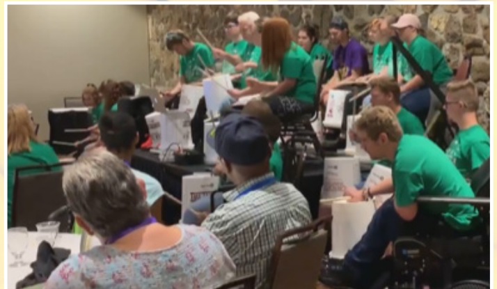
"2019 CC Rhythm"